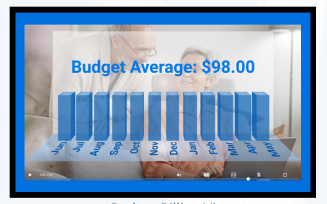
Budget Billing View