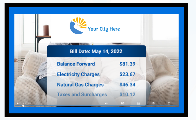
Bill Summary View